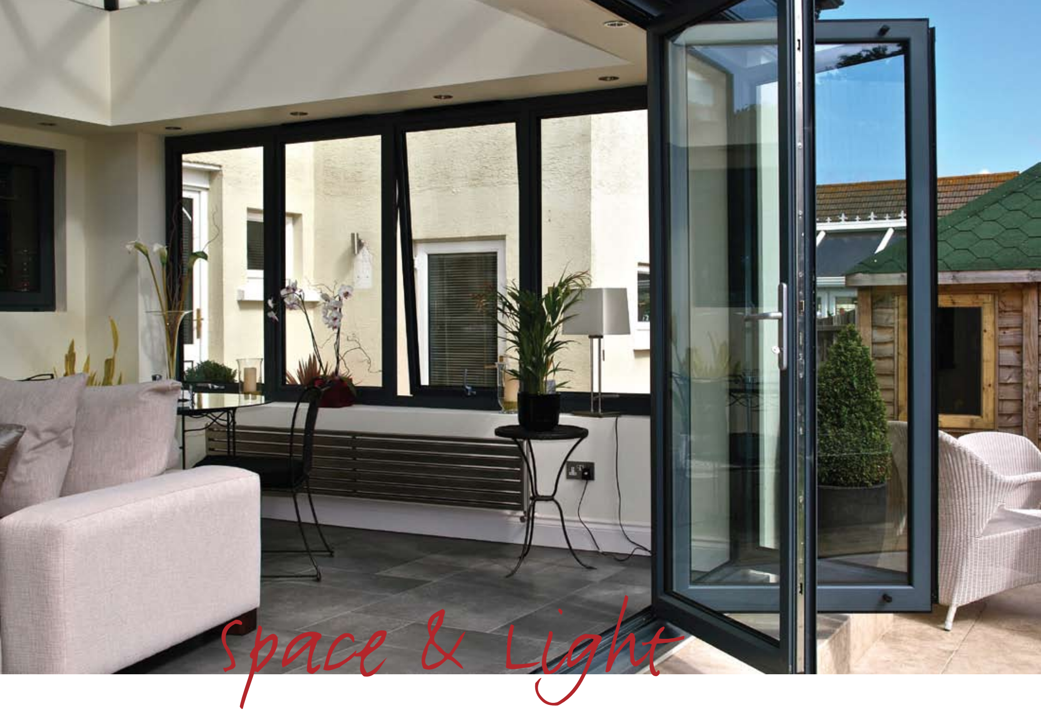
NARROW SIGHT LINES ALLOW MAXIMUM LIGHT TO FLOOD INTO A ROOM