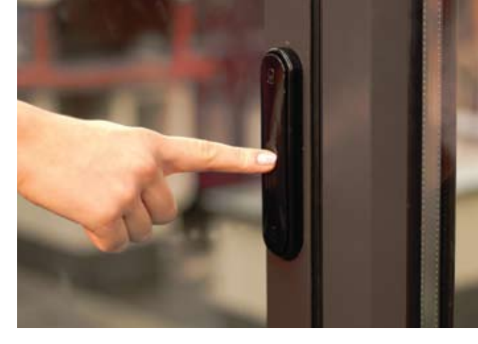
Unique, flush line pop-out handle that allows maximum door opening

All intermediate doors have heavy duty shoot bolts that secure the doors top and bottom and are operated by T-handles. Traffic doors have high security multipoint locking consisting of two substantial hook locks, latch and dead bolt. Rhino also fit an extra-high security anti-snap, anti-bump locking cylinder as standard. The dedicated guide on each of the bogie wheel assemblies runs within the outerframe, preventing the doors from being forced out of the frame.